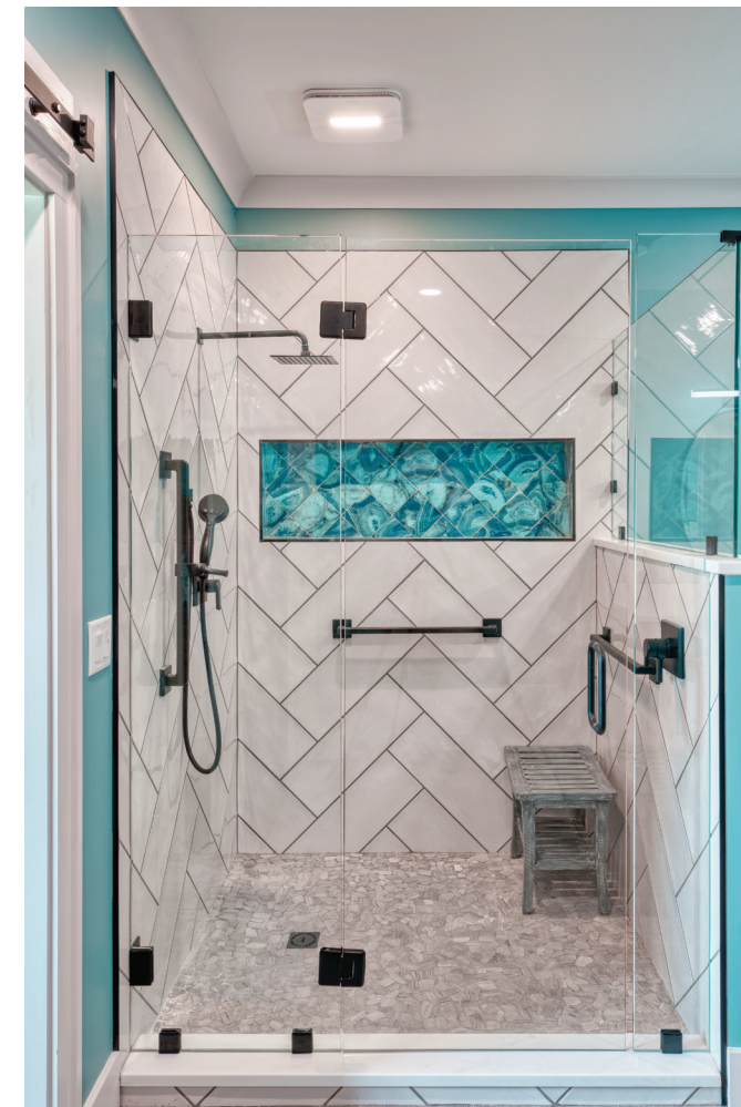
OPPOSITE PAGE: The vibrant remodeled bathroom has tons of space and style. ABOVE: A custom niche in the shower complements the bathroom walls and cabinets. ABOVE RIGHT: Matching vanities were placed on separate walls to allow for an open floorplan. RIGHT: A custom Western cedar sauna was installed in the previous water closet space.

Those colors, including walls painted in St. John Blue by Benjamin Moore and Galapagos Turquoise cabinets also by