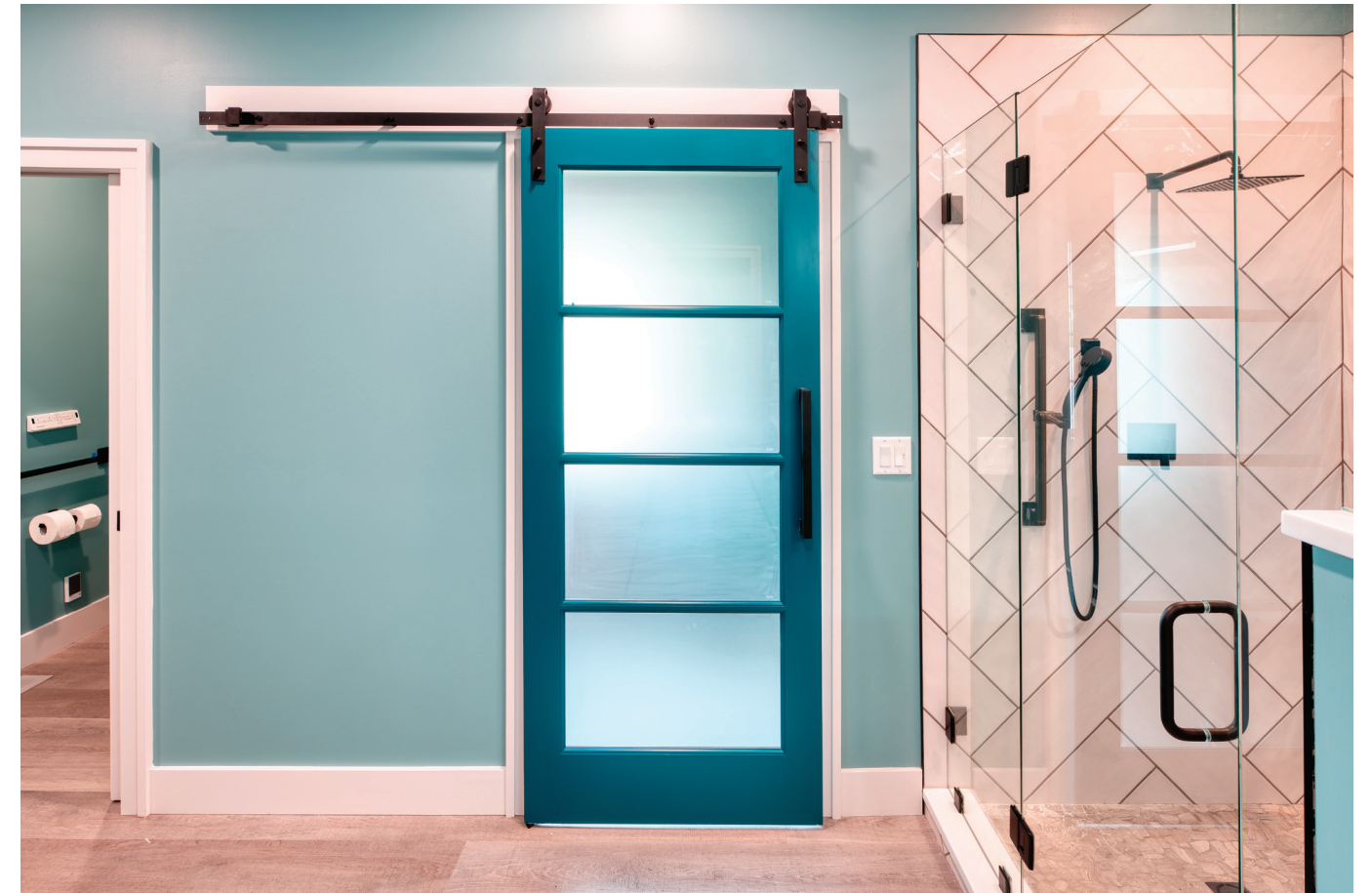
ABOVE: A barn door with frosted glass panes replaces a traditional closet door.