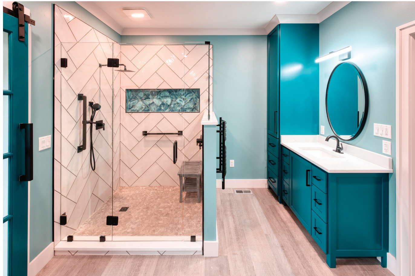
ABOVE: Shower features include a heated floor, grab bars, and a heated towel rack on the half wall. RIGHT: Shelving was removed from the closet to allow more room for clothes rods.

This heated seat plugs into the wall, fits most elongated toilets, and operates with the touch of a button. A pocket door provides privacy in the water closet while taking up little space. Likewise, the closet's barn door allows for unobstructed floor space and the large, frosted glass panels maintain the open, airy feel of the room. With numerous grab bars, low/no thresholds and wide doorways, this ground-floor bathroom is optimally designed for aging in place gracefully.